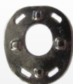
Cinch Plate CFL708A